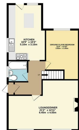
1ST FLOOR 527 sq.ft. (49.0 sq.m.) approx.